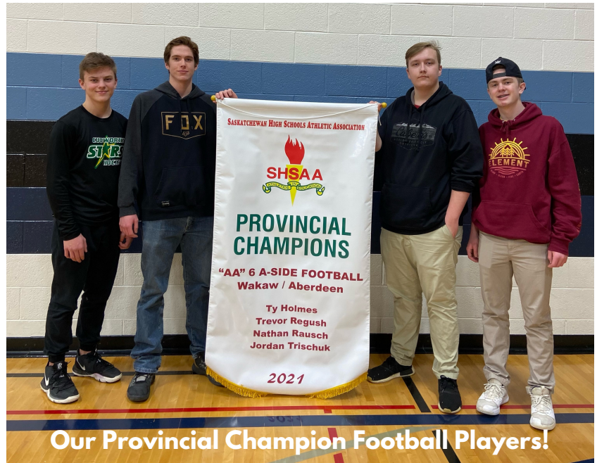
Our Provincial Champion Football Players!