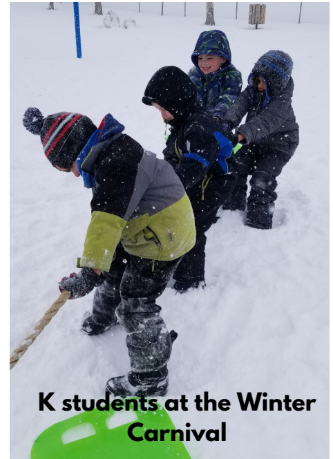
K students at the Winter Carnival

Finally, we wanted to let you know that as a school community, we seem to have navigated the transition away from COVID restrictions really well. Students have been respectful of each other and at school, we have been focused on learning - it feels great!