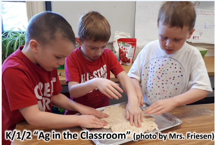
K/1/2 “Ag in the Classroom”