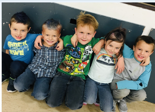
K/1/2 STUDENTS “WACKY HAIR DAY”