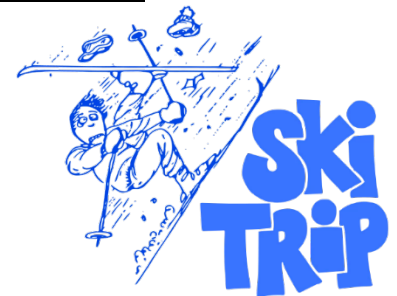
TABLE MOUNTAIN March 6 th GRADES 6-12