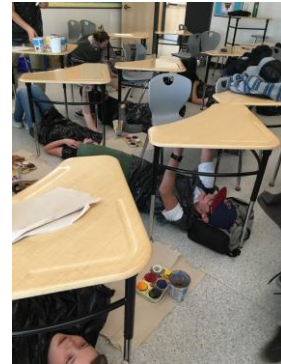
Painting like Michelangelo in History 10

November 22&23- Parent Teacher Interviews (details in Nov. Newsletter)