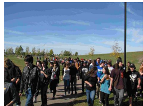
2017 Terry Fox Walk