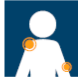
Aches and pains