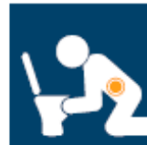
Nausea or vomiting