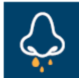
Runny nose or congestion