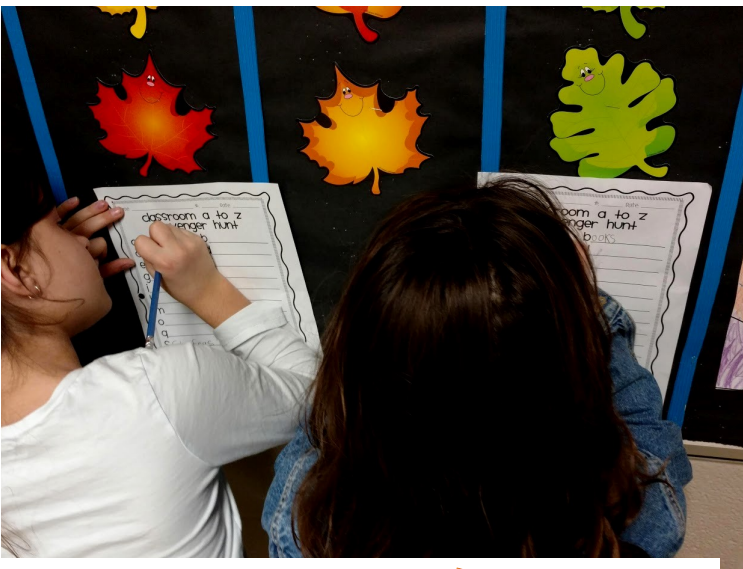
Alphabet Scavenger Hunt— Grades 1-6.