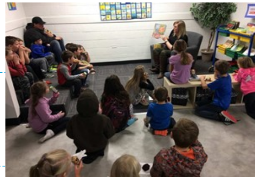
We had a great turn out for Breakfast and a Book again this year! Thanks to all of the parents and students who participated.

Our School Goal: "To foster a culture of literacy that instills a lifelong appreciation of reading and writing for various purposes and audiences"