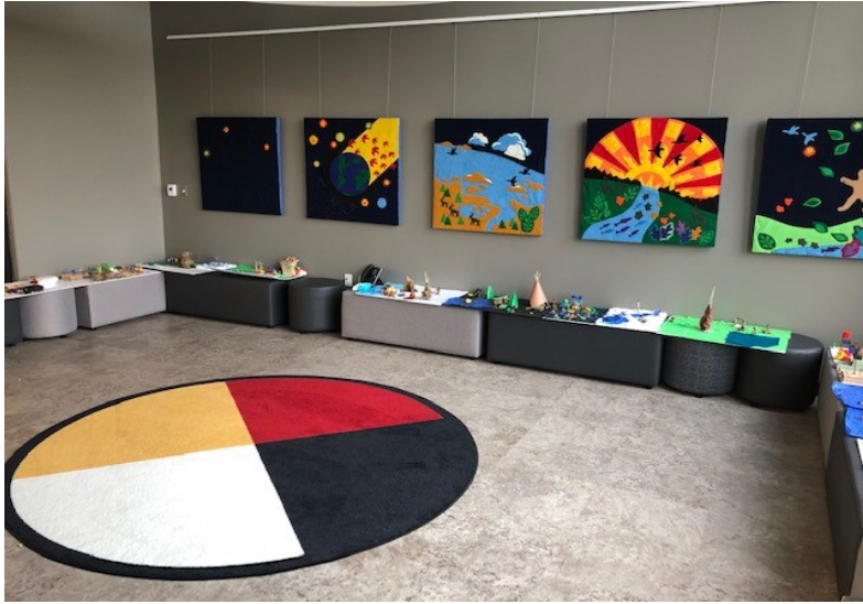
Top Left: Cultural Room displaying grade 5 dioramas