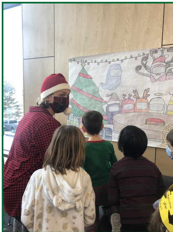
RCS Christmas banner judging—Congratulations to our winners the grade 8's