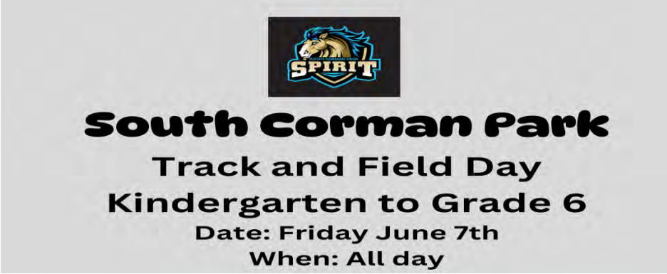
Track and Field Day – June 7, 2024

Mark your calendars – Friday June 7 th is Track and Field Day at SCP! Reminder - Subway lunch will be delivered that day for those that ordered!