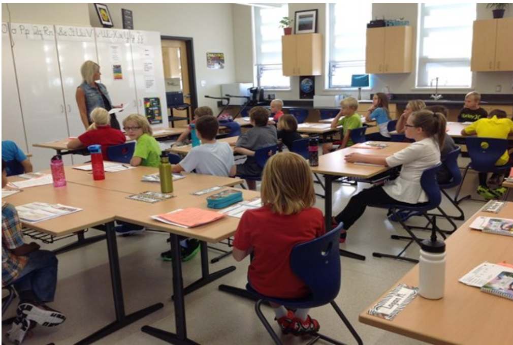
Students from 4Werle engaged in learning