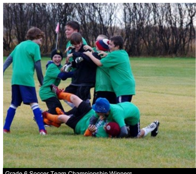
Grade 6 Soccer Team Championship Winners