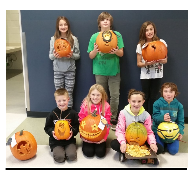
Pumpkin carving contest winners

Students interested in participating should pay attention to the announcements and bulletin board by the gymnasium for specific information over the next few weeks.