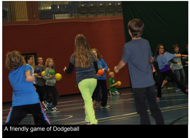
A friendly game of Dodgeball