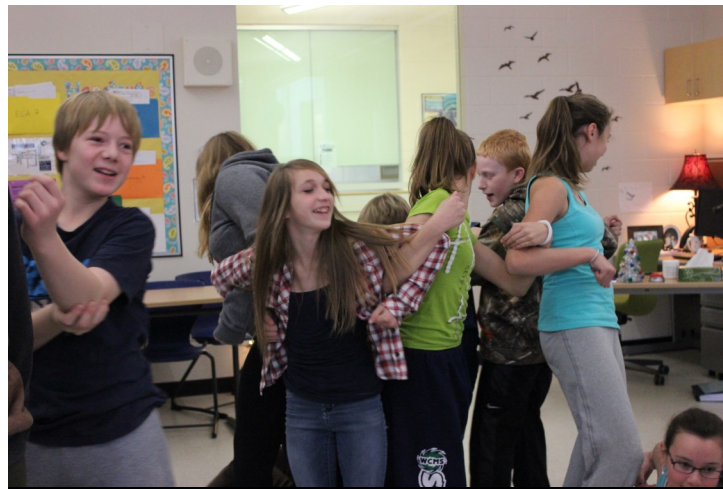
Fun Times in 7Dyck