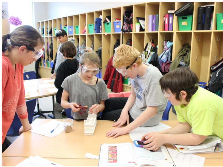
Grade 7 Experiments