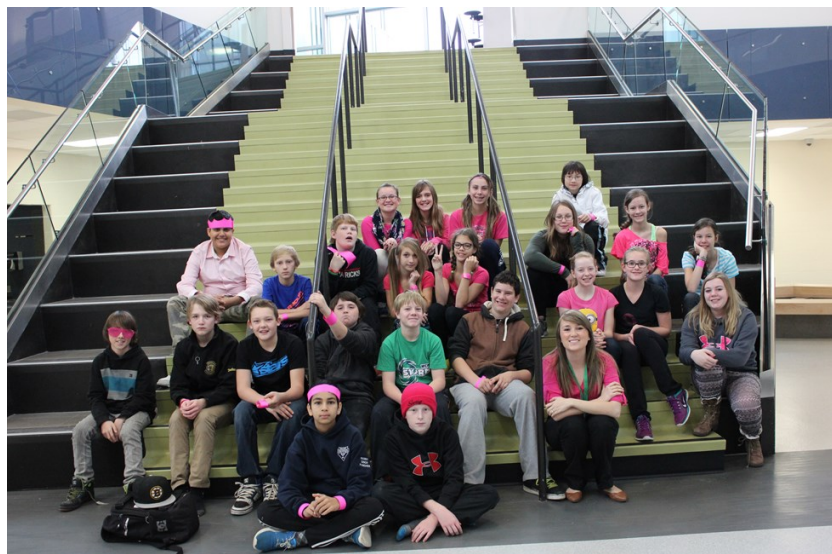
7Dyck's class—Day of Pink to support cancer