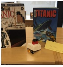
Some of the Lego creations for Library Club.

Please remember that you can always check your child's library account by logging on to wheat-land.sk.ca with the library card number. The pin number is defaulted to the last 4 digits of your phone number.