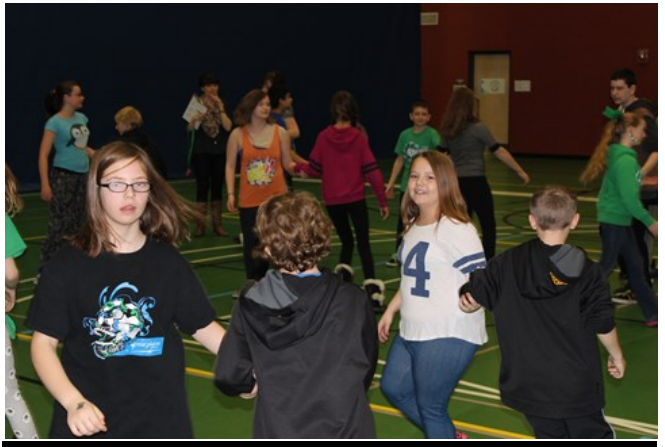
Square Dancing Lessons at WCMS!!