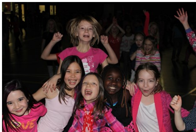
Fun Times at the Sock Hop