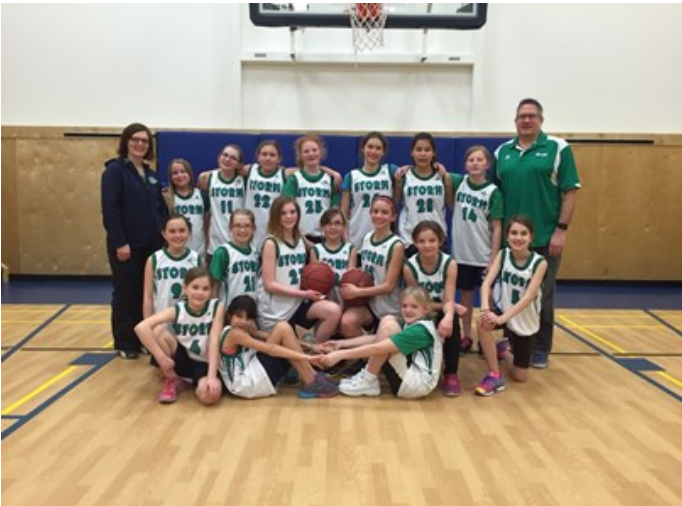
Grade 6 Girls Basketball Team (missing: Gracey P.)