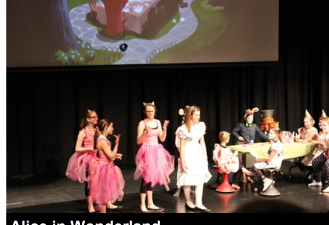
Alice in Wonderland