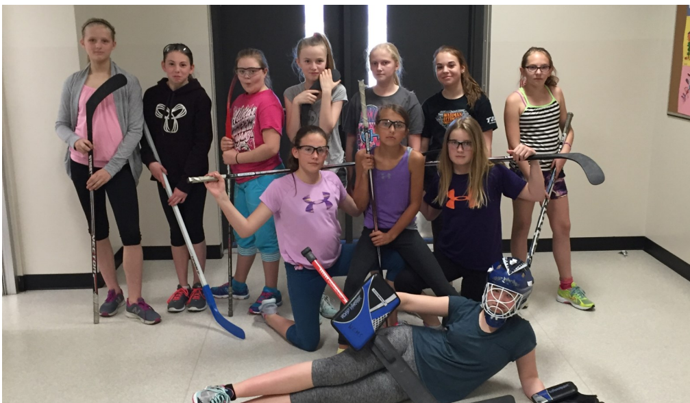
Grade 6F Girls Floor Hockey Team