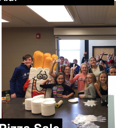
WaterAid Pizza Sale