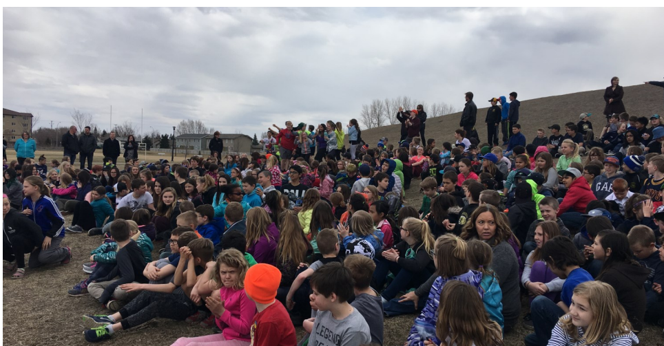
WaterAid presentation on the Big Hill

“You may only succeed if you desire succeeding; you may only fail if you do not mind failing”