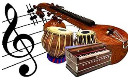
Hindusthani Classical Musical Instruments

Information that was emailed home last month about our school's BAND and DRAMA/DANCE/MUSIC (DDM) programs